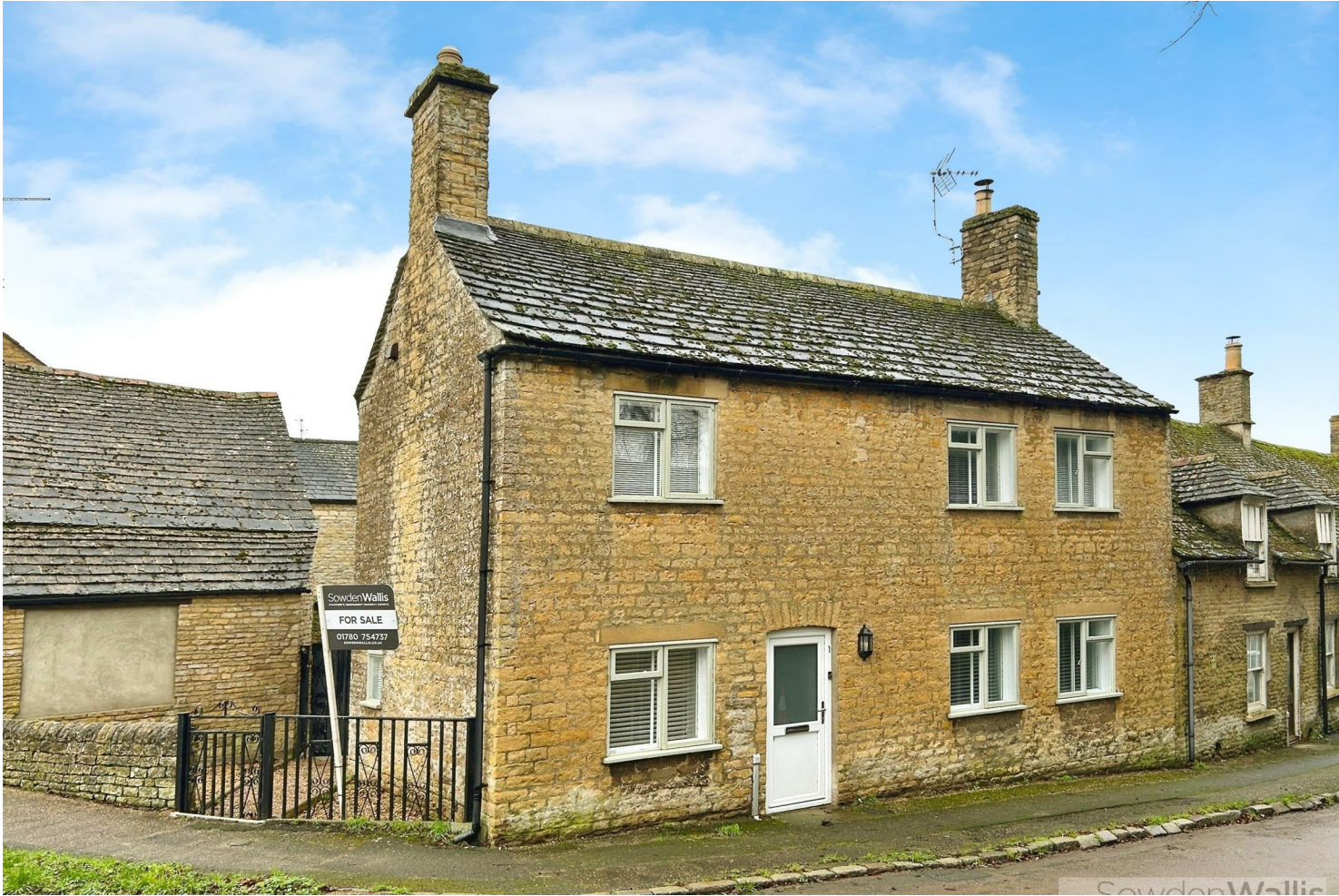
1 High Street, Collyweston, Stamford, PE9 3PW